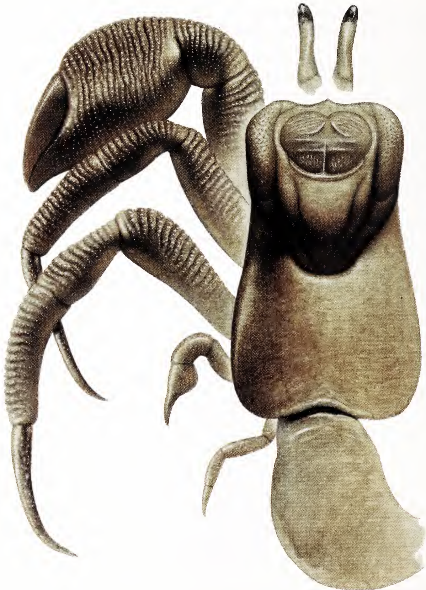
Fig. 3 – Striadiogenes frigerioi n. gen.; n. sp., reconstruction / ricostruzione.

Left and right ambulatory legs equal, exceeding chelipeds by approximately 0.25 length of dactylus; corrugated dorsal and ventral margins; merus and carpus of P2-P3 with corrugated striae partially superimposed and arranged vertically; dactyli broadly curved approximately as long as propodi, and terminating in sharp corneous claws; proximal part of dactyli with one marked ridge extended medially; numerous small pits not aligned dorsally and distributed along all length of dactyli.